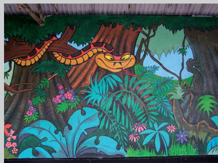
Mural at Ravenswell designed by Greg Murray