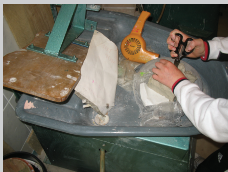
Learning to work with clay