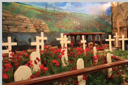
Signal artwork for the Flower Festival at Christ Church