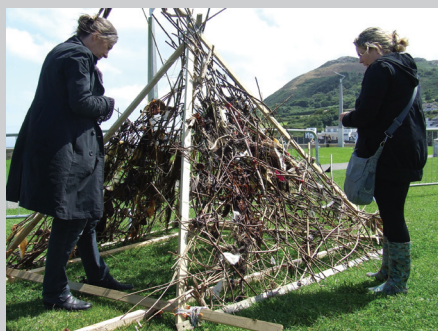
Willow weaving at Bray Summerfest