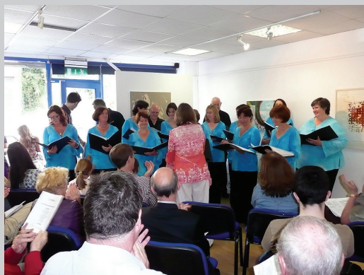
Cantanto concert at Signal